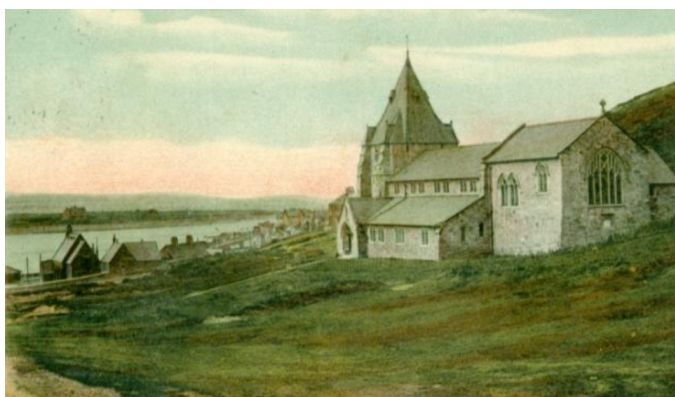
All Saints Church - once the only building on the hill at the foot of the Vardre and a prominent landmark that could be seen for miles around. Since the 1980s houses have been built around and in front of it and now it is all but invisible from the main road.

On 1st November 1899 at a very well attended service All Saints church was consecrated by the Bishop of St Asaph in the presence of 'a fashionable and representative congregation' with many local dignitaries. According to local press reports it was 'adorned with green-house ferns, palms and flowery plants from Gloddaeth Conservatories'.