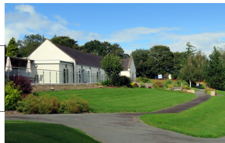
Right: Ty Gobaith Hospice