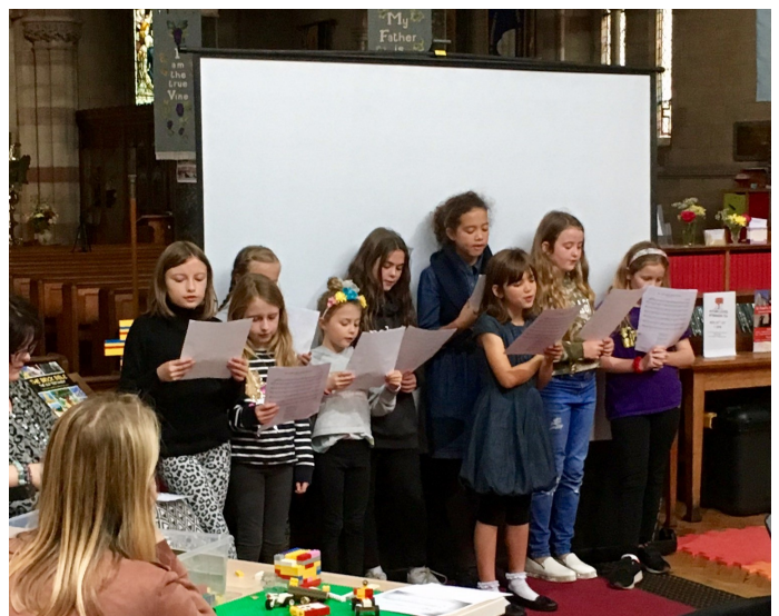
Pictured above: St Paul's Church Junior Choir at their first performance - the family harvest service. The choir was set up in September following the children's holiday club in August.

PRAYER HOUR AT ST MICHAELS AND ALL ANGELS LLANDUDNO JUNCTION Every Thursday Morning 10.00 – 11.00 am